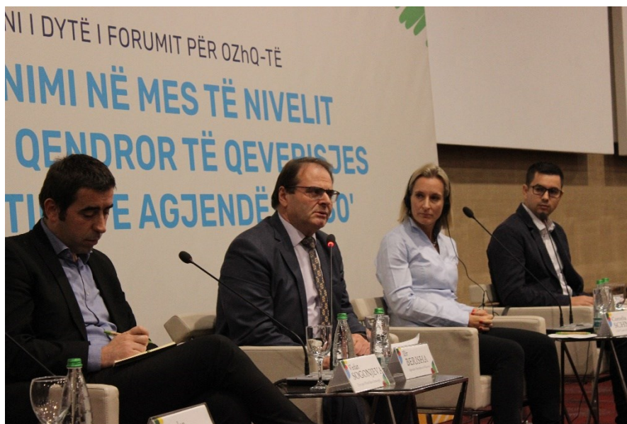
Image 4. View during the roundtable "Technical support, monitoring and reporting for the implementation of SDGs at the national level"

For the discussion panel entitled 'Technical support, monitoring and reporting for the implementation of the Sustainable Development Goals at the national level', representatives of the central level, foreign international organizations and representatives from the private sector were invited. Thus, to attempt the involvement of all relevant actors for a genuine implementation of the SDGs and the 2030 Agenda in the country. Since Kosovo still lags far behind in terms of the implementation of the Sustainable Development Goals in general, the participants in the