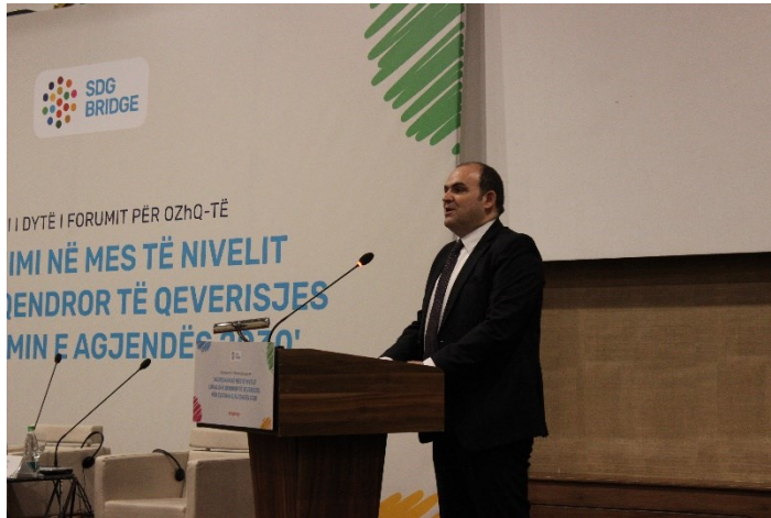
Image 3. Introductory speech of the executive director of the INDEP Institute