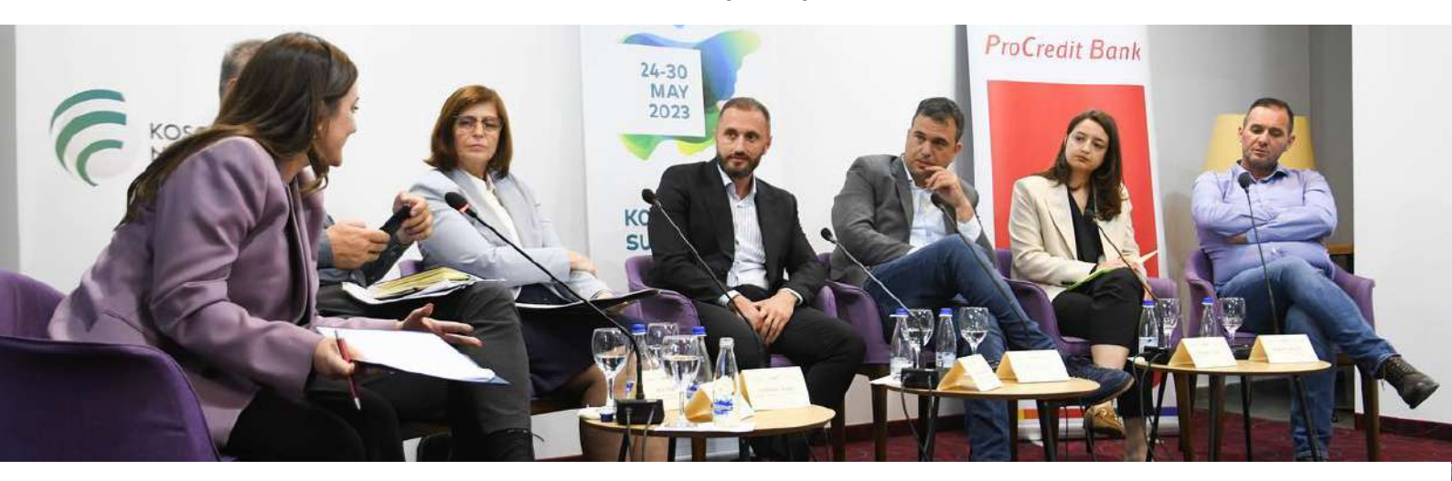
Roundtable: 'Agroecological transformation': channeling public funds for sustainable agricultural adaptation to climate challenge