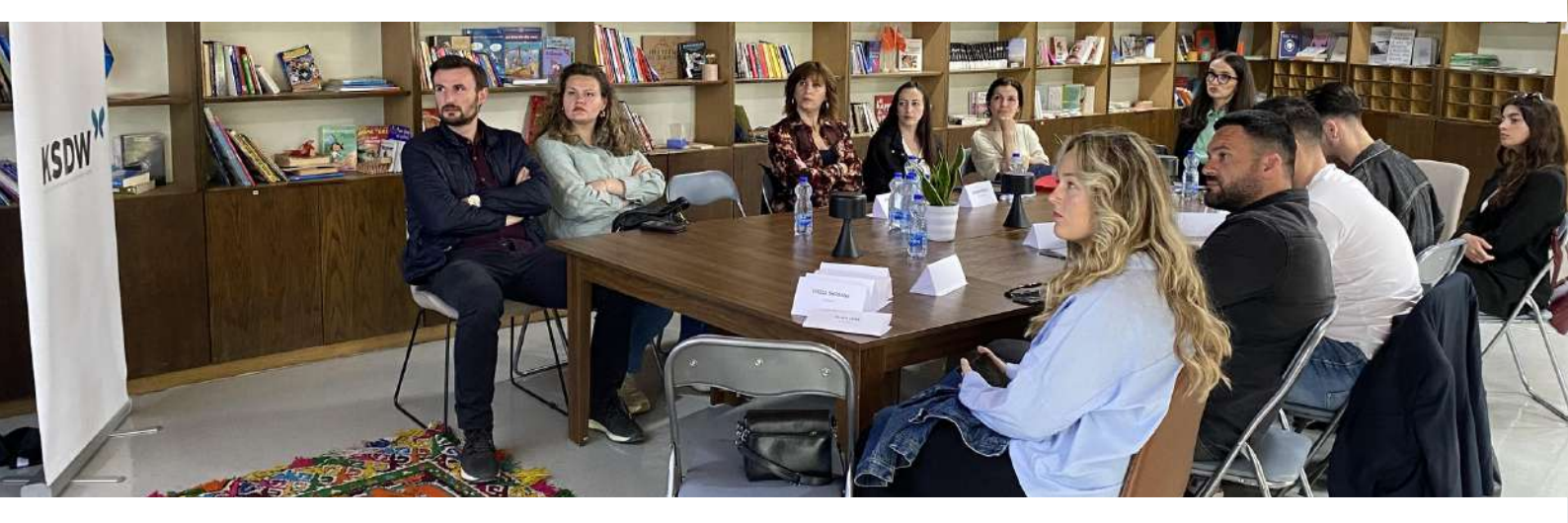
Roundtable: 'End Plastic Pollution - Sustainable plastic production business models and Finance'