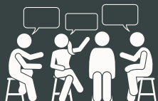
INTEGRATION OF SDGS INTO KOSOVO'S PUBLIC POLICIES ROUNDTABLE