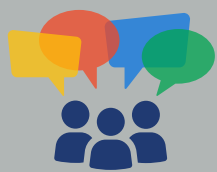
3RD SDG FORUM