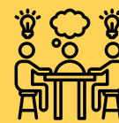
ADVANCING SUSTAINABLE MOBILITY ROUNDTABLE