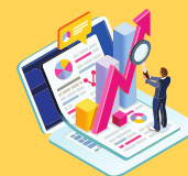
SDG MONITORING REPORT